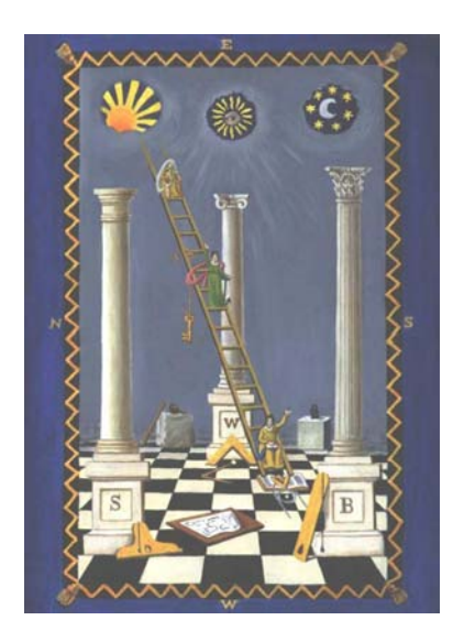
Picture 1. Freemasonry lodge with the three pillars of different styles

The architecture of the ancient people in which the dominating were the Macedonian dynasties and the Macedonians is considered to have been created bythe old cultures (from Minor Asia and the Mycenaean culture) and was developing from VII until Vcentury BC. The temple had been the main carrier of the architectural style, which was built to honor a certain god. The most important part of the temple is the pillar. There are differences in the looks of the pillar in the ancient architecture out of which later on different under stylesemerged: Doric, Ionian and Corinthian style of building. The building material had been the stone, mortar, brick and wood. In the freemasonry, those styles are still fostered in their lodges, picture1.